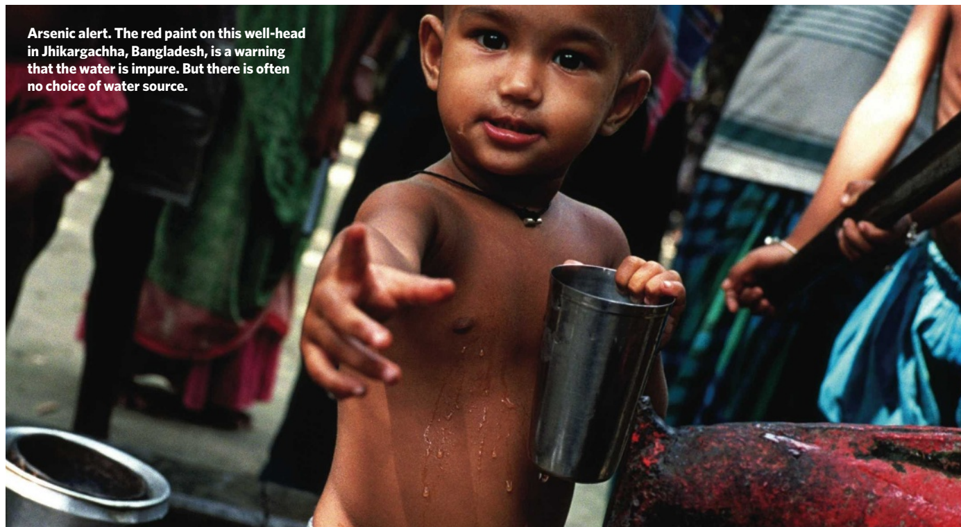
Arsenic alert. The red paint on this well-head in Jhikargachha, Bangladesh, is a warning that the water is impure. But there is often no choice of water source.